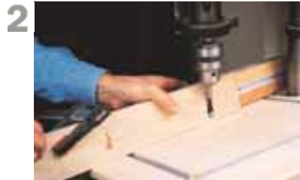
Another view of the drill-press table. Here I'm cutting pocket holes in a table apron.

First, a fence that slides forwards and backwards as well as left and right on either side of the quill. This last feature also uses the drill press' tilting table feature with the auxiliary table for angled drilling.