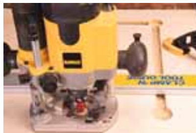
ROUT THE GROOVE The grooves for the T-